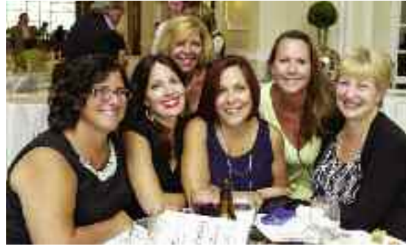
The Bayshore Community Hospital nurses came together for this group photo!