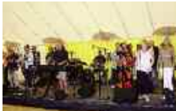
The Holiday Express band was amazing, as usual!