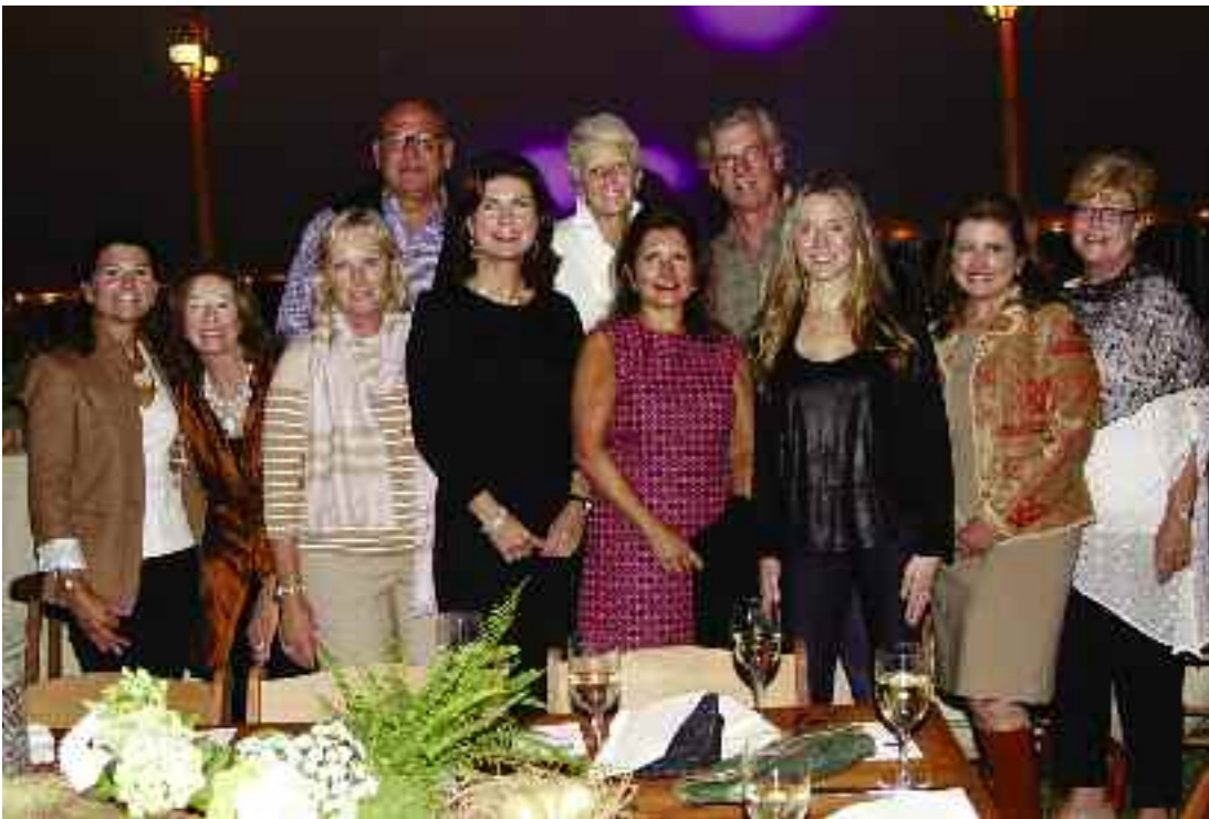
Pictured are the members of the Monmouth County Historical Association board of trustees .