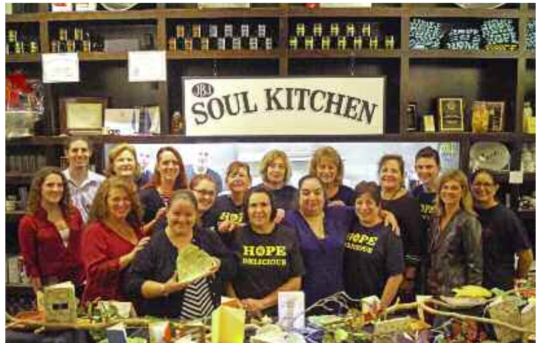
Monmouth University students came out to support the event.