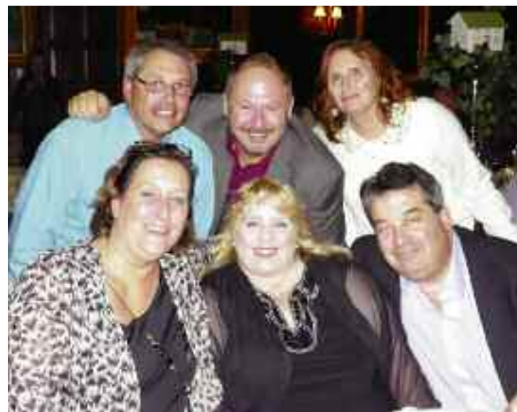
Employees from event sponsor Raymour & Flanigan , Ocean Township, supported the event.